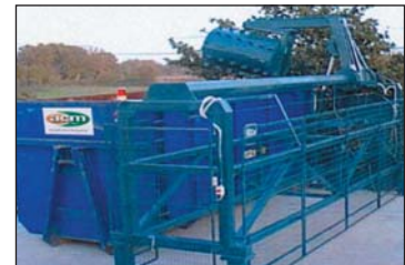
Used in standard containers