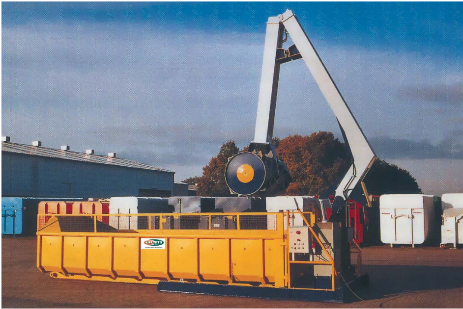
Space saving end compacting ACM Gigant Roll Packer