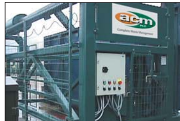
Full safety guarding