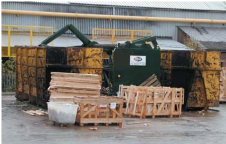
Twin headed ACM Mammoth Roll Packer for maximum compaction

The crushing operation takes place safely and securely within the 2.5 meter high steel container thereby eliminating any potential exposure to injury.