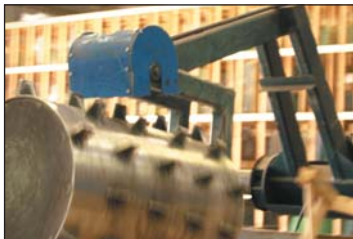
1750kg drum for maximum compaction