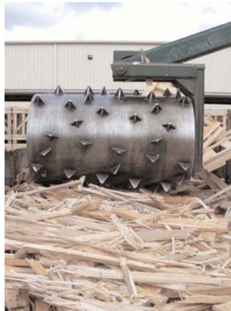
Unique 3-dimensional movement design for greater compaction and durability